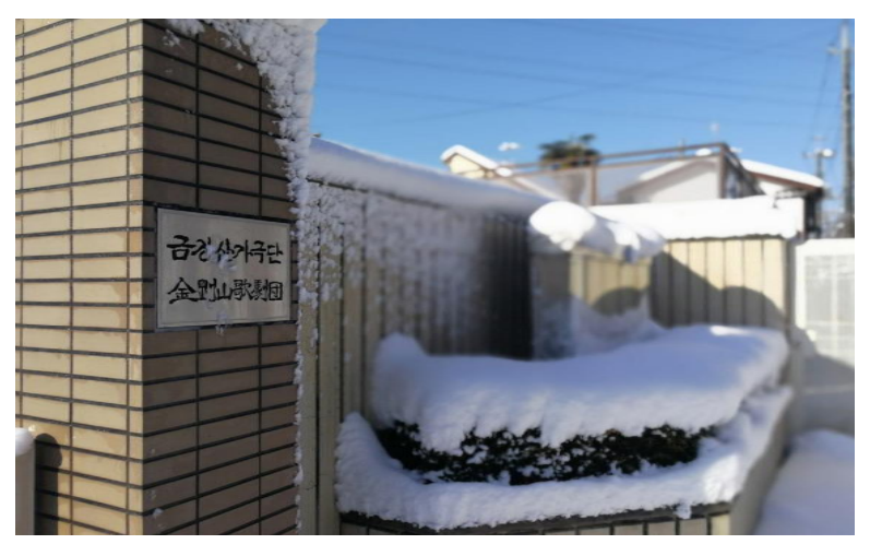
Figure 1. Kŭmgangsan Kagŭktan, Tokyo, Japan

Another interesting note is that Zainichi artists have been advancing their artworks into global cities. The 2008 group exhibition ZAINICHIART held in Shanghai's Foundry Gallery may be the first time that Zainichi art systematically brought its voice to China<sup>11</sup>. Cities like Suzhou and Hangzhou have had exhibitions featuring North Korean contemporary oil paintings as well. It is worth noting that in April 2014, Tokyo's eitoeiko gallery showcased the exhibition Z3(Zainichi Korean third Generation of Art)<sup>12</sup>, as a group show portraying generations of Zainichi art. But still, Zanichi art is often taken as joint exhibitions with Japanese and Korean counterparts, while its genres are limited with few installation artworks.