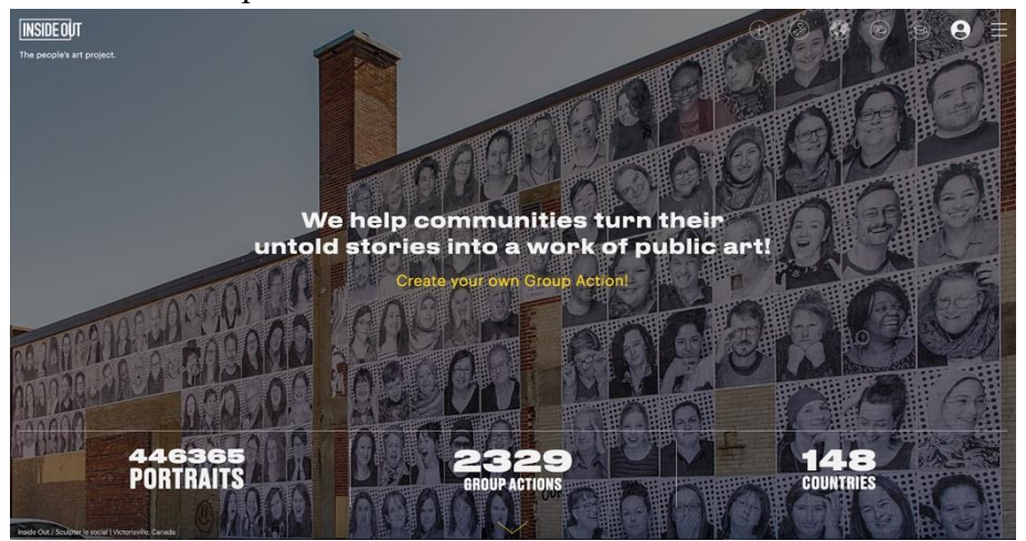
Figure 5. The cover page of the Inside Out Project's website

"Ghost maps preserve the visibility of older, prior shapes beneath those that have taken their place in later times<sup>19</sup>."