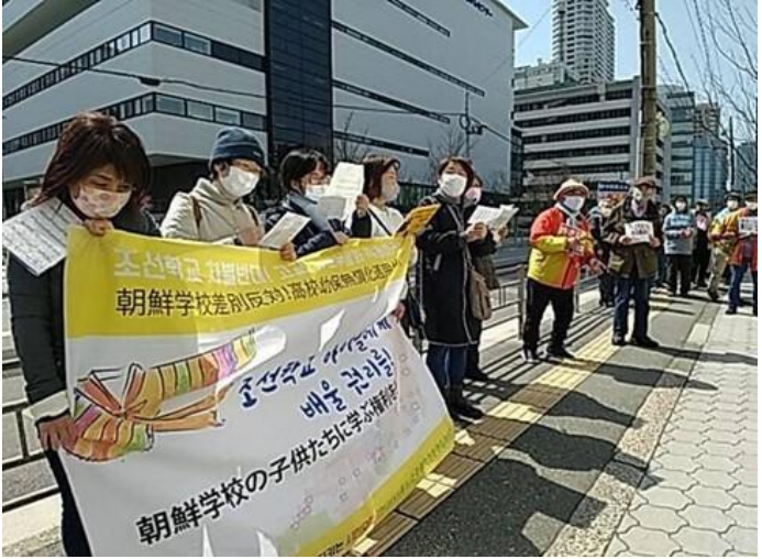
Figure 6. The 420th Tuesday Action on March 23, 2021. The supporters of Chōsen schools have held weekly demonstrations in front of the Osaka Prefectural Government building for eight years. Photo courtesy of = = = = 000 \ge 9 \ge 2

they have been forced to live in their own social circle because of many reasons including political ones. Therefore, having the participants have their portraits printed on very large paper and posted on the exterior walls of Chösen schools might receive resistance. However, according to the Asia-Pacific Journal, the Supporters of Chösen schools have held weekly demonstrations in front of the Osaka Prefectural Government building for eight years which has accumulated 420 demonstrations with banners and speeches. The project gains confidence from the high number of non-stop actions of the Chösen schools supporting group in Osaka and sees the eagerness of hope to protect Chösen children to receive education in Japan.