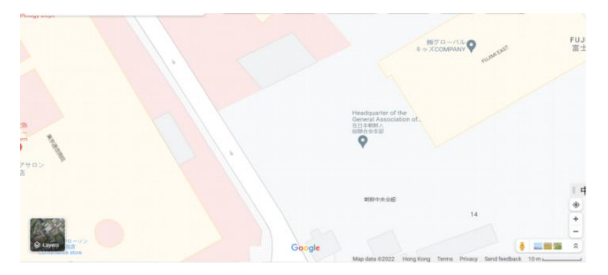
Figure 2. The General Association of North Korean in Japan on Google Map

The General Association of North Korean in Japan has similar functions as an embassy even though no diplomatic relation has been established between these two countries, so this association is the only political representation of North Korean authority and the North Korean diaspora in Japan. However, the General Association of North Korean in Japan can hardly be seen on google map. A good map tells a multitude of little white lies; it suppresses truth to help the user see what needs to be seen<sup>13</sup>. The google map has to be zoomed in to a 10-meter measuring scale to see an incomplete name of the association on the map. When the google map is turned into a 100-meter measuring scale, even the incomplete name of the association becomes invisible. Compared to this, the embassy of the People's Republic of China and the Embassy of Germany can even be seen clearly in a 200-meter measuring scale on google map. This big difference shows the extreme marginalization of North Koreans in Japanese society.